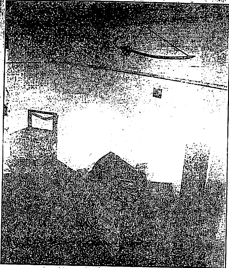
Full-scale reproduction of a captain's quarters containing artifacts from the Cushman collection.

Duxbury. The Society's Exhibit Committee, chaired by Sally Redmond, has been busy assembling two special exhibits for the 2002 season. Lost Duxbury is a photographic exhibit that celebrates many aspects of our town that are gone forever — its buildings, industries, views and lifestyles.